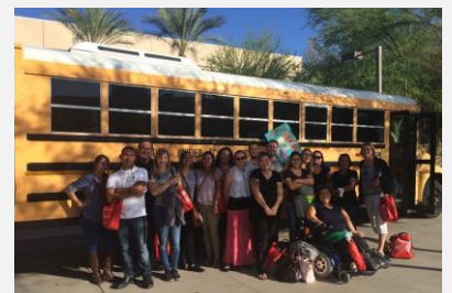
KidZone staff attending the annual AZCEA conference.