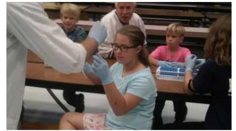
Picture: Children, at Copperwood, participating in the Zombie MD program with the AZ Science Center.